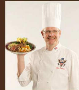
Jefferson Clinton, and President George W. Bush. We believe this will be a once in a lifetime experience and has never been done before in our area.

Make plans to attend an exciting evening of dinner and entertainment, the Taste of the White House Dinner Gala.